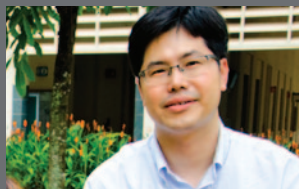
Where Anonymous Feedback is Welcome