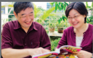
Diagnosing Misconceptions through Assessment