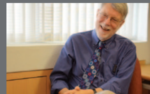
Learning in a Changing World