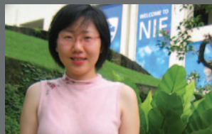
Using Feedback to Enhance Learning