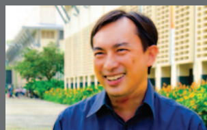
Learning Beyond Assessments