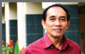
A Good Test