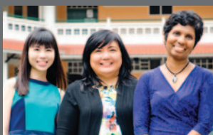
Using Performance Tasks to Assess Learning